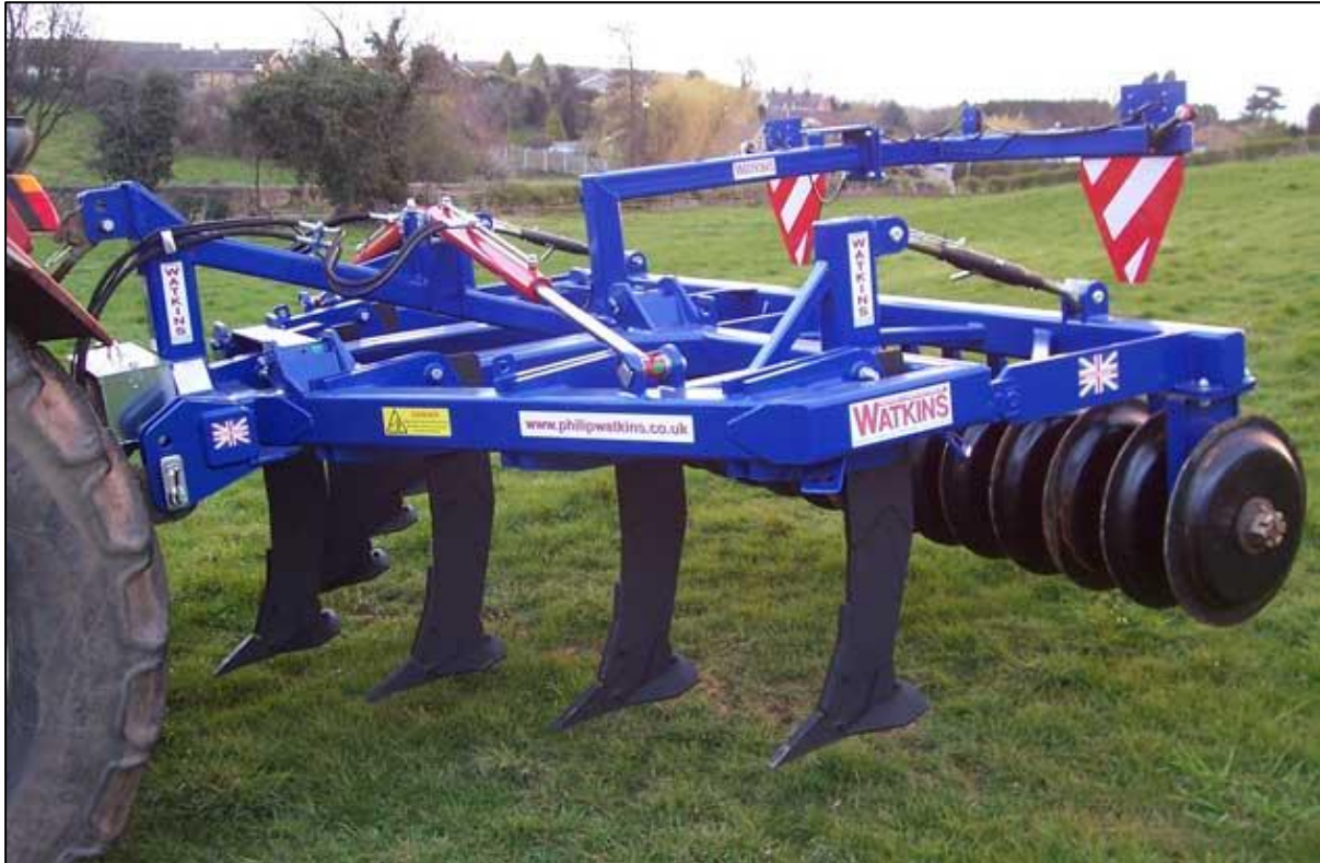
Plate 2: Tractor mounted subsoiler