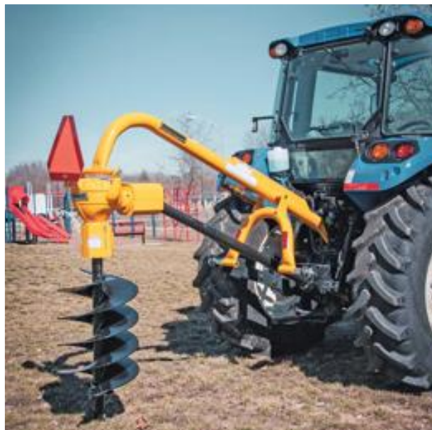
Plate 4: Tractor mounted auger type post hole digger

7.2.2. Palisade fencing post holes will be dug using the same technique as detailed in Paragraph 7.2.1 . A 50-100mm layer of gravel will then be compacted in the base of the hole by hand. This will be brought to the Site using a tractor and trailer or small dumper. Once the post has been positioned, the holes will be filled with concrete. This will either be a bagged dry mix concrete poured into the hole by hand and then watered, or wet mixed onsite using a standard sized cement mixer, or concrete delivery lorry. Concrete will be transferred into a mortar tub to prevent soil contamination. Washings and left over concrete and cement will be disposed of safely offsite in accordance with the measures detailed within the Outline Construction Environmental Management Plan [EN010158/APP/7.2] and appended Outline Site Waste Management Plan [EN010158/APP/7.2] . Horizontal rails and vertical pales will be installed by hand once the concrete has set.