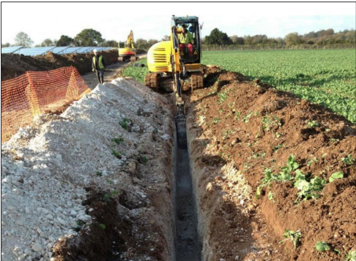
Plate 3: Cable trenching, showing topsoil stripped and set to one side, with subsoil placed on the other side ready for reinstatement

6.2.1. Trenching for cable laying is mostly undertaken using a mini-digger or trenching machine, as shown in Plate 3 .