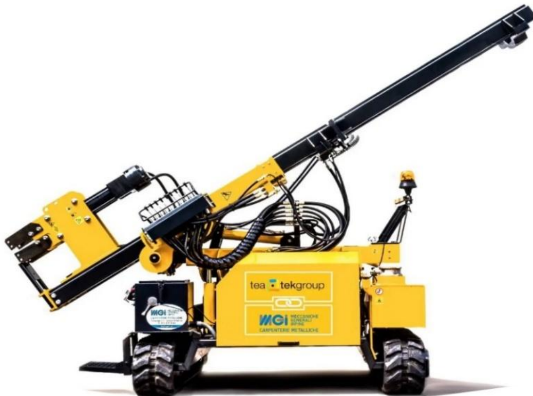
Plate 1: Example of a low ground pressure pile driver