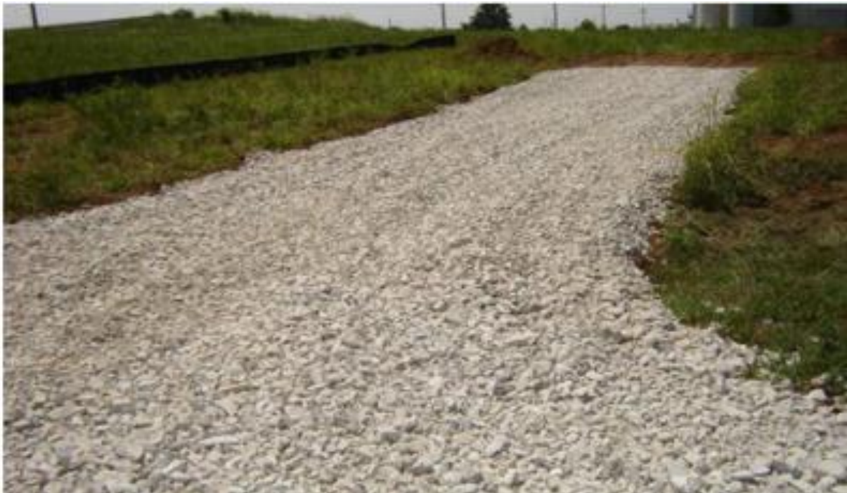
Plate 5: Temporary access track

8.2.1. Temporary compounds and access tracks will usually be constructed of compressed aggregate on top of a permeable membrane, which is used to prevent mixing of aggregate and the soil, as shown in Plate 5 .